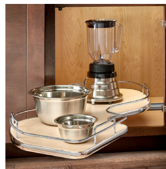
RS5371 Single Tier